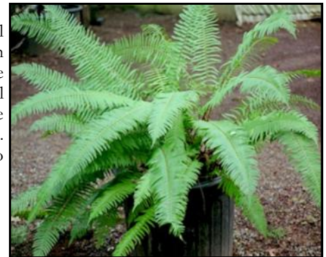
Western Sword Fern

Friends of Cottage Lake will be having our fall native plant sale on Saturday, October 13th from 1pm to 3pm. This plant sale is unique because we sell the plants below normal retail prices. The idea is to increase access to native plants for gardens and landscapes in our area. Proceeds will be used for FOCL projects to improve Cottage Lake water quality.